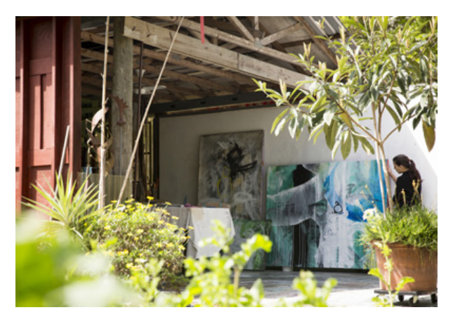
Lake County Tour Stop #5, Brenda Heim Studio

different maps and go behind the scenes at dozens of professional artist studios in North Central Florida.