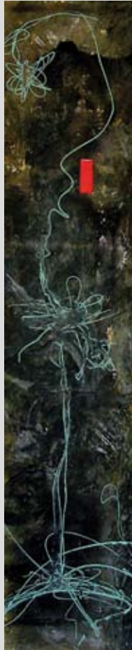
PDF19 Ikebana 2 17" x 7" Acrylic on canvas