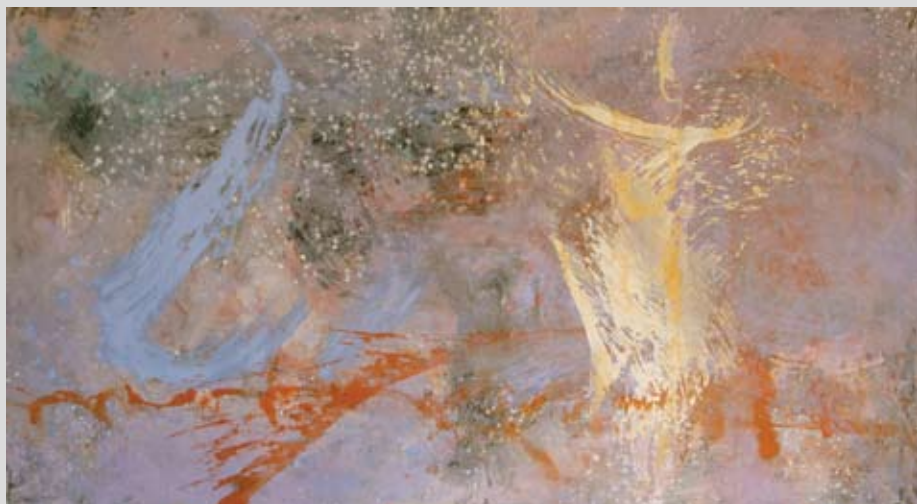
PDF1 Here and Now Meets Destiny 6' 9" x 3' 9" Acrylic on canvas