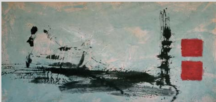
PDF13 Land HO! Steady As She Goes 9' x 4' 2" Acrylic and Sumi Ink on canvas