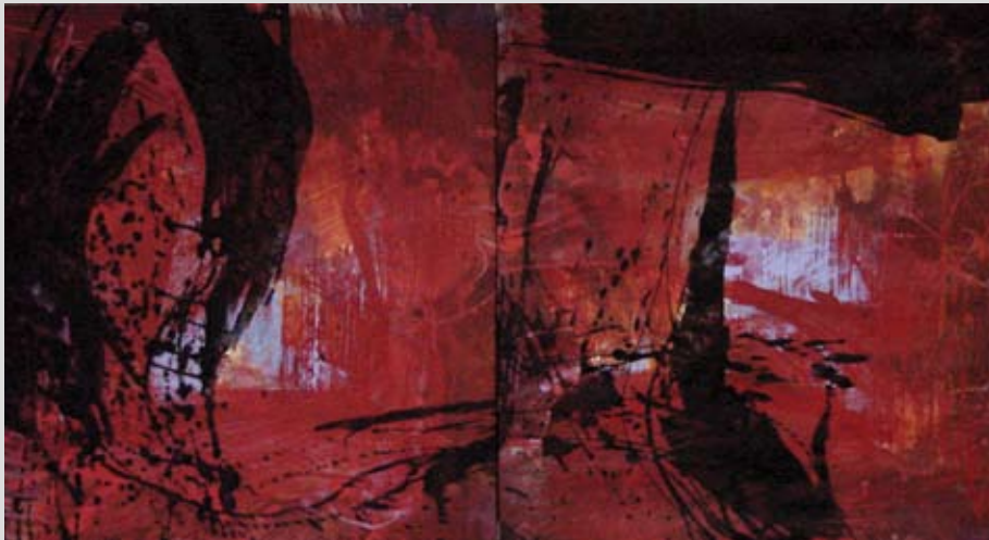
PDF23 Portal 3, You and Me... (a reference to Spirit and self) each panel 26" x 28 1/2" Acrylic with gold leaf metallic powder on canvas