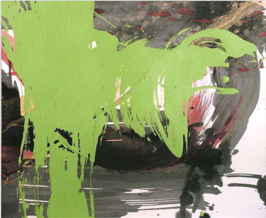
PDF33 Homage to Motherwell 11" x 9" Acrylic on watercolor paper