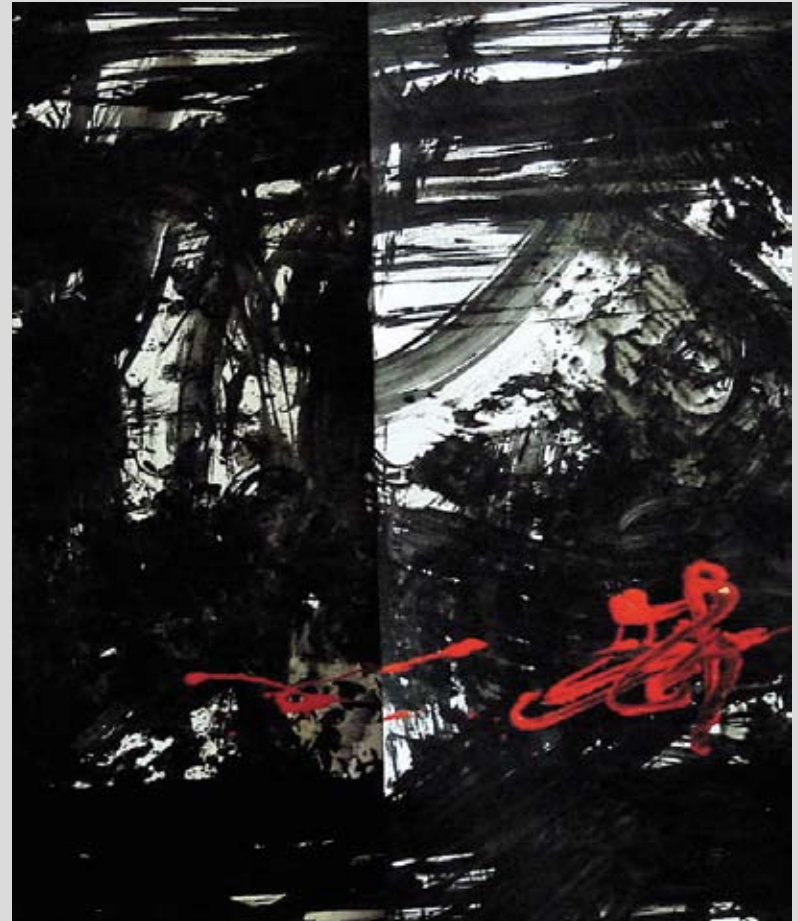
PDF10 Divine Order of Chaos Two panels, 18" x 24" each Acrylic & ink on watercolor paper