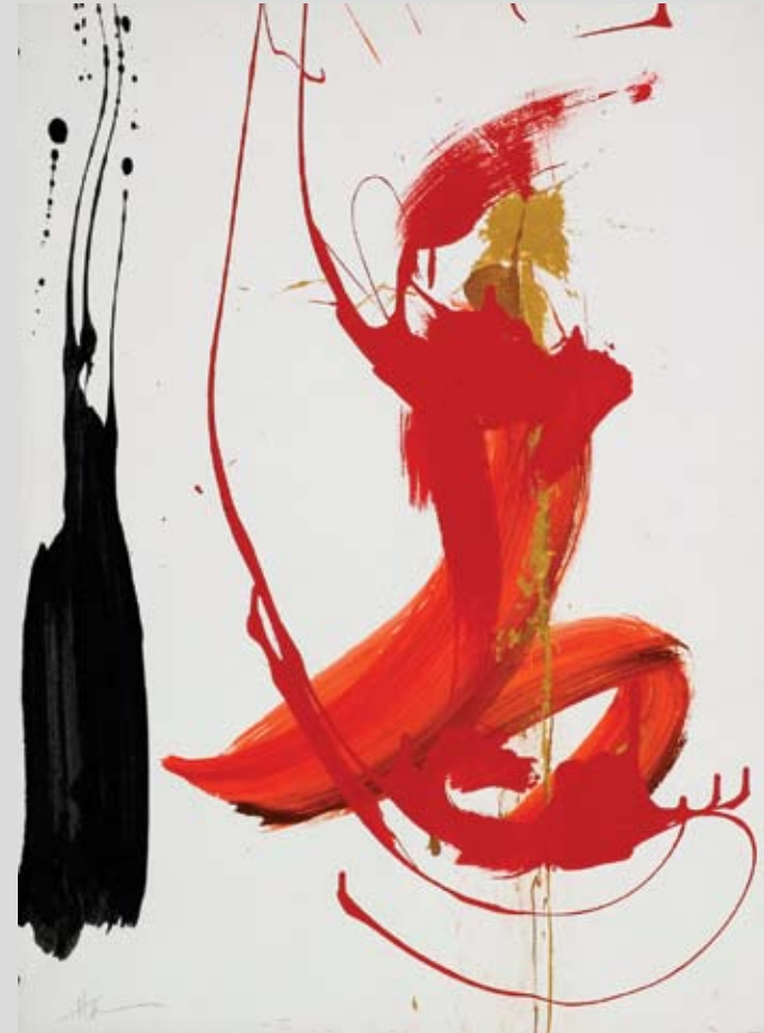
PDF24 Sword of Honor 11" x 14" Giclee, S/N limited edition on canvas