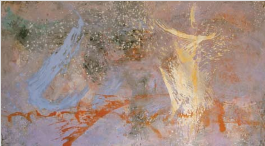
PDF1 Here and Now Meets Destiny 6' 9" x 3' 9" Acrylic on canvas