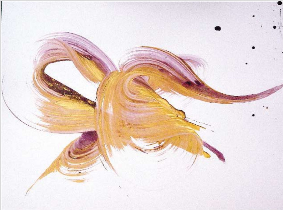
PDF25 Abstract Calligraphy Plum & Gold 2 30" x 22" Acrylic on watercolor paper