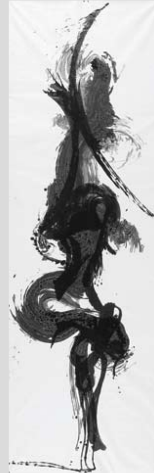
PDF12 YangShe Dragon 3' x 9' Sumi Ink & Enamel on canvas