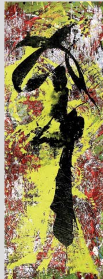
PDF28 Sumi Ink Abstract / Chartreuse 24" x 64" Acrylic and Sumi Ink on canvas