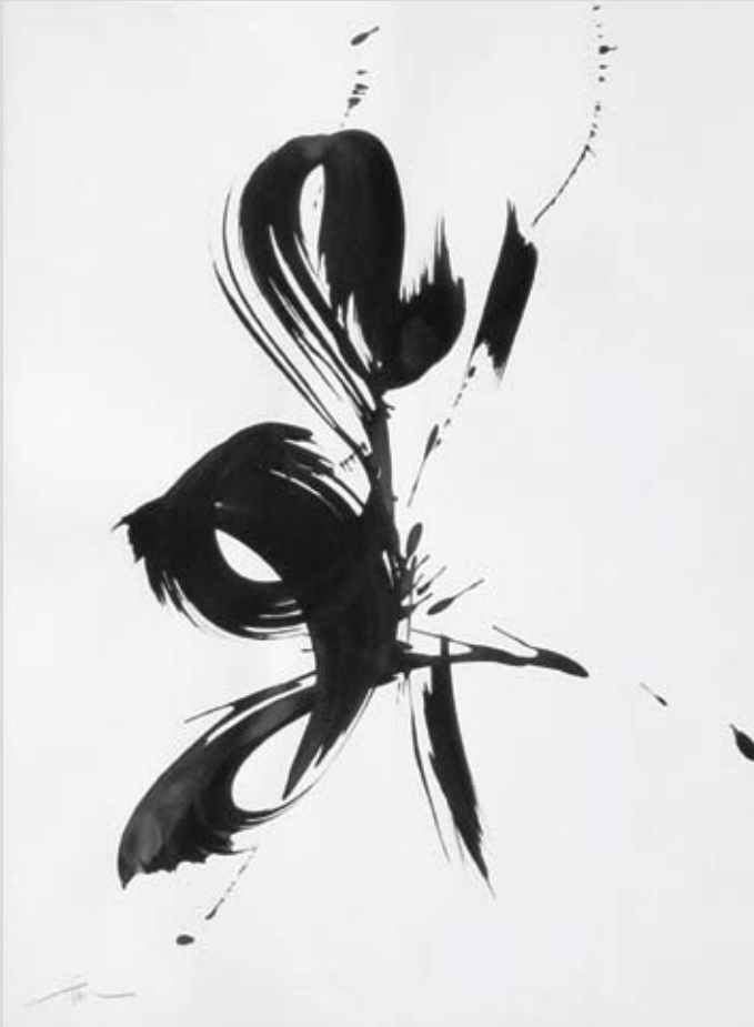
PDF15 Abstract Calligraphy Black/White 5 22" x 30" Sumi Ink on watercolor paper