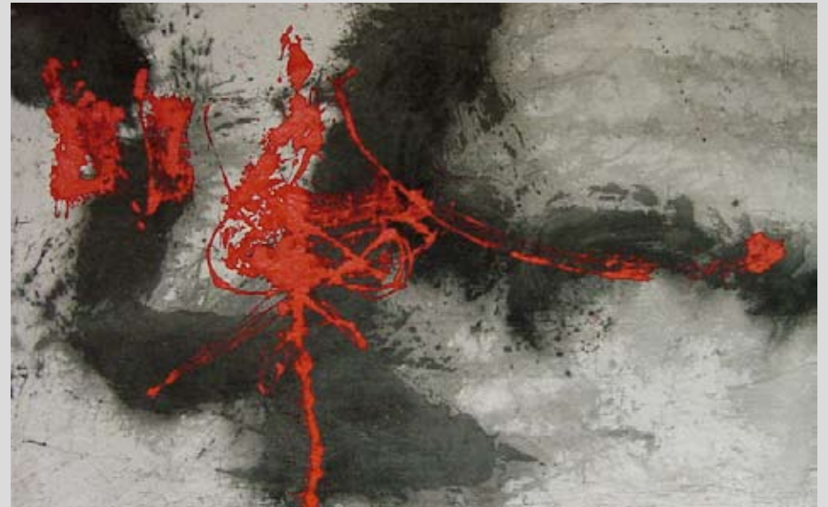
PDF4 Oriental Abstract 5' 5" x 3' 5" Enamel on raw canvas