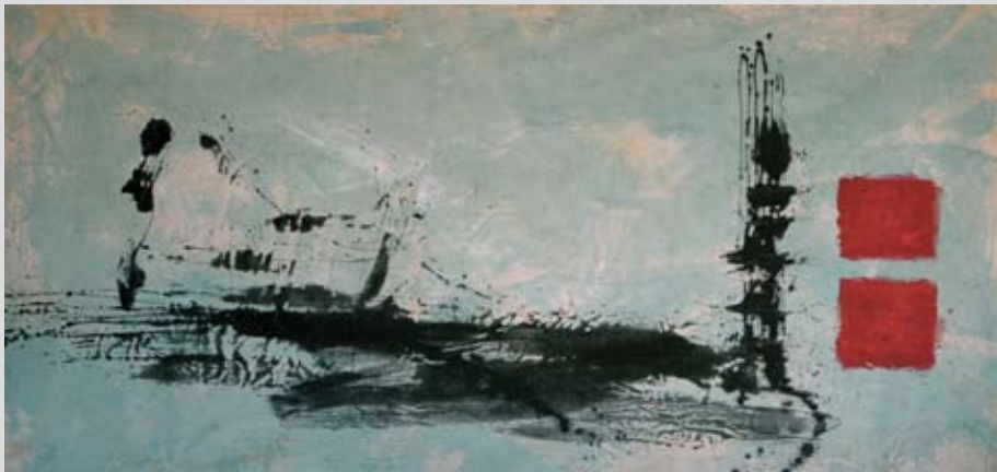
PDF13 Land HO! Steady As She Goes 9' x 4' 2" Acrylic and Sumi Ink on canvas