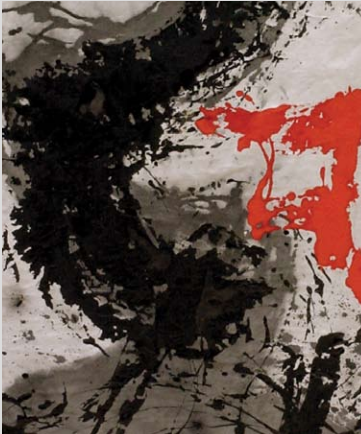
PDF11 Oriental Abstract, Black & Red 2 2' x 32" Enamel on raw cotton duck canvas