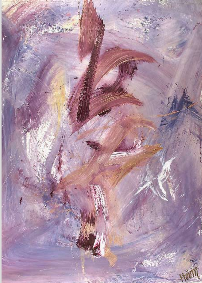
PDF31 You and me...a story of Love 5' x 7' Acrylic on canvas