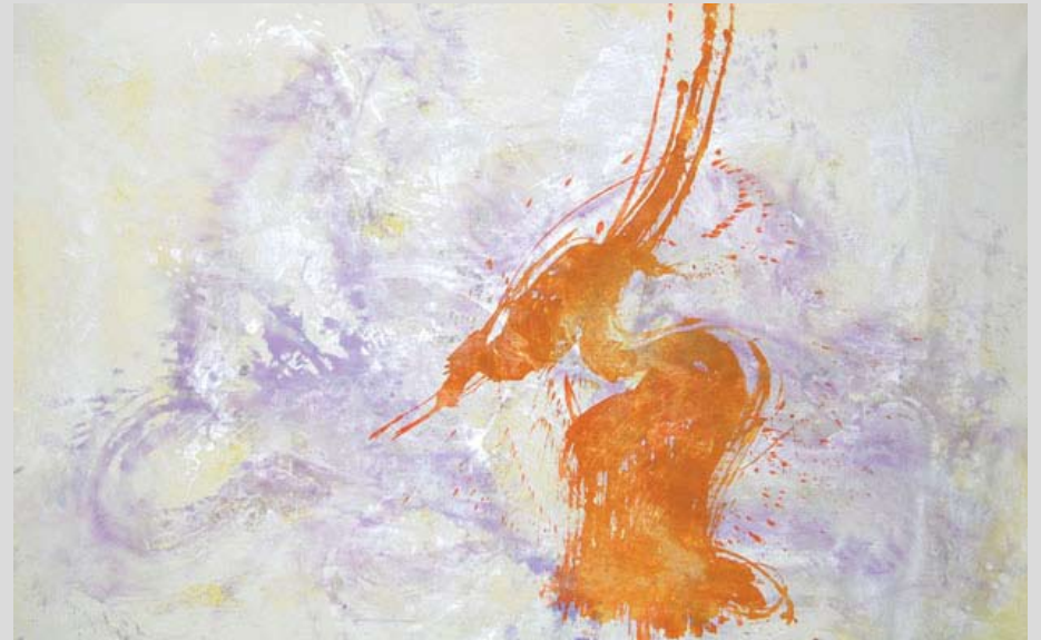
PDF34 Plan A release-Plan B ice cream 6' x 4' Acrylic on canvas