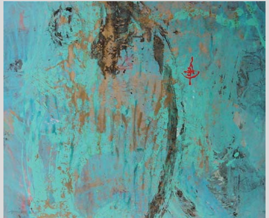
PDF2 The Guardian 4' 9" x 3' 9" Acrylic & gold leaf metallic powder on canvas