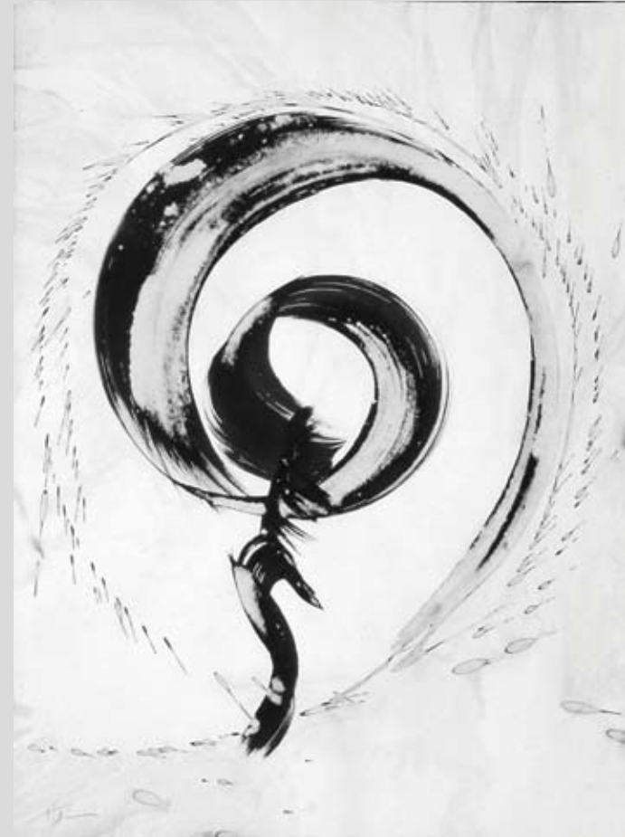
PDF14 Abstract Calligraphy Black/White 6 22" x 30" Sumi Ink on watercolor paper