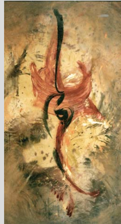
PDF30 Learning to Dance 3' x 7' Acrylic and Sumi Ink on canvas