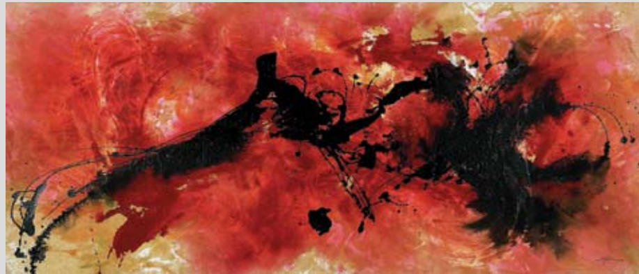
PDF29 New View 28 1/2" x 5' 6" Acrylic and Sumi Ink on canvas