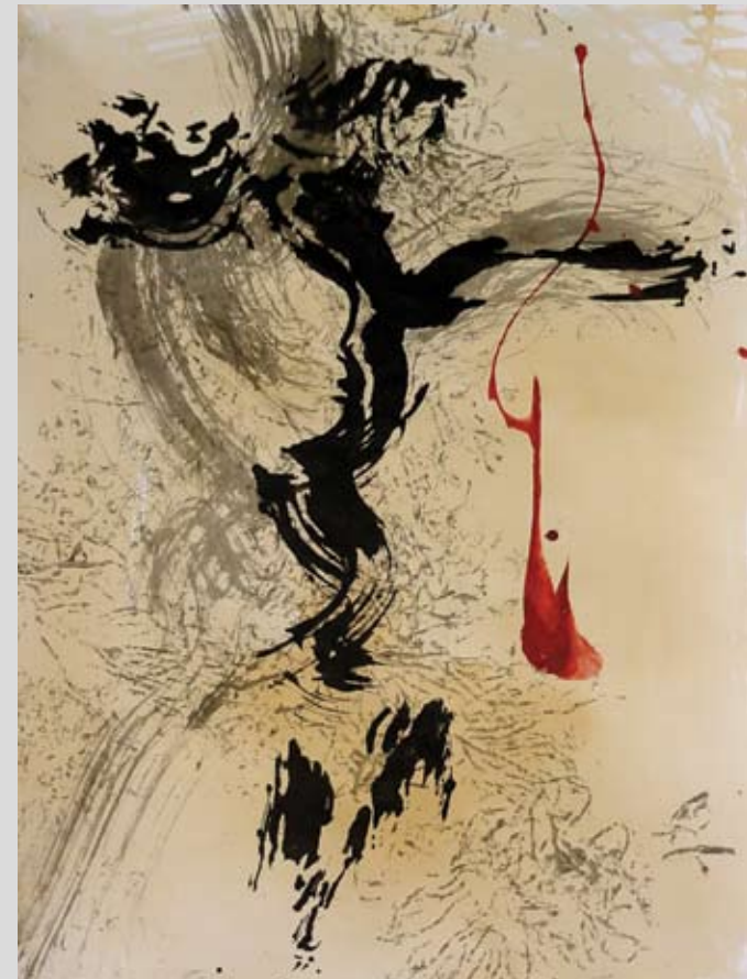
PDF8 Dancing Brush 1 18" x 24" Acrylic & ink on watercolor paper