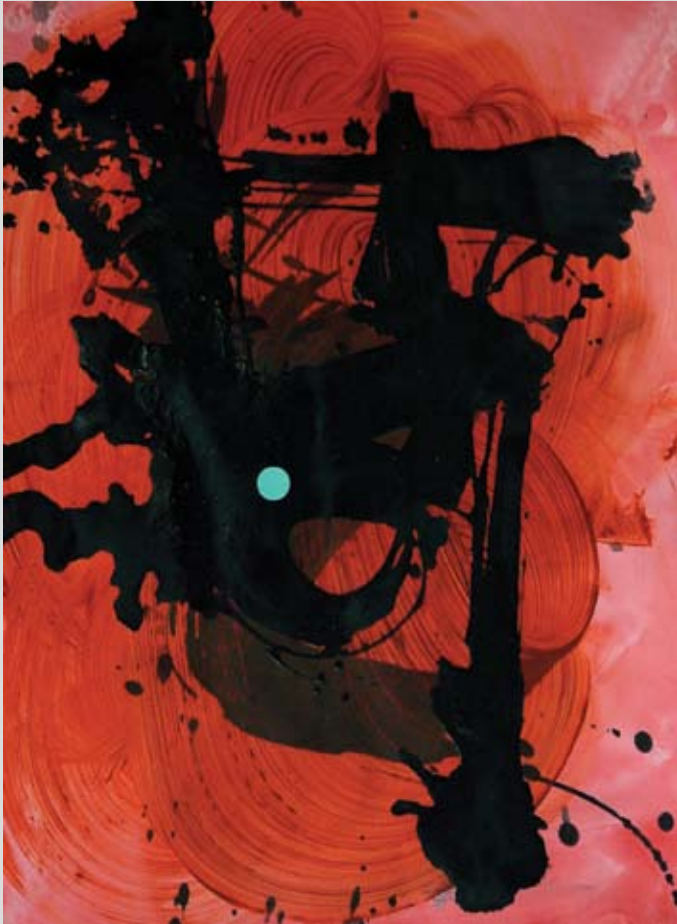
PDF17 Turquoise Pearl 1 of 2 22" x 30" Enamel and Acrylic on watercolor paper