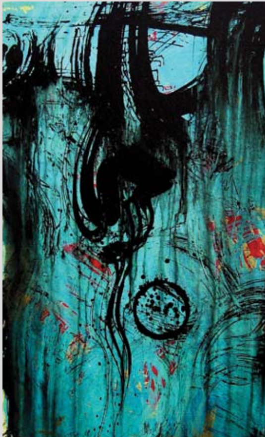
PDF7 Planting Seeds 34" x 56" Acrylic and enamel on canvas