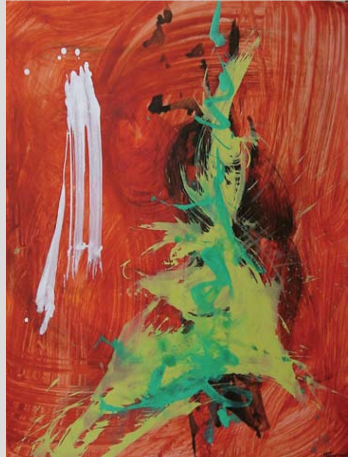
PDF22 Saffron Scribe 2 22" x 30" Sumi Ink and Acrylic on watercolor paper