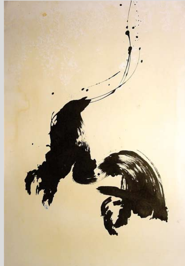
PDF36 Black Tea Gestural 2 30" x 44" Acrylic on tea stained watercolor paper