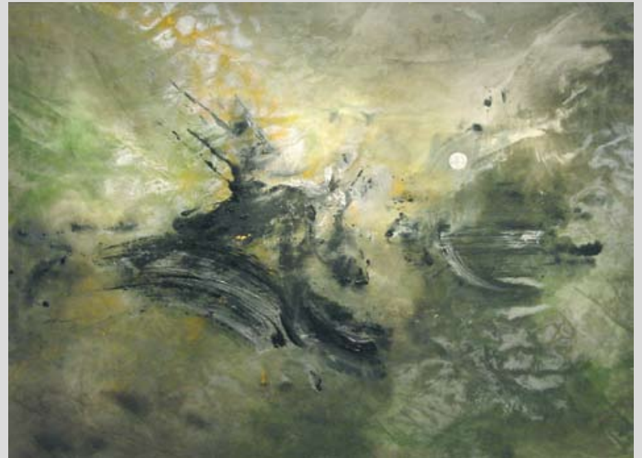
PDF32 The Way . . . is in God's hands 7' 8" x 4' Acrylic & Sumi Ink on canvas