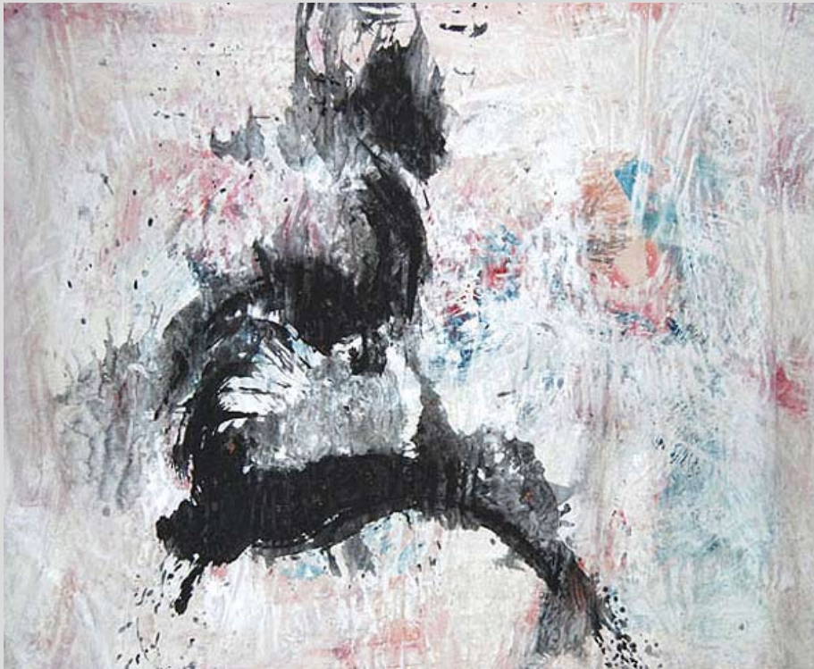
PDF35 The Sentinel 6'2" x 5'2" Acrylic on canvas