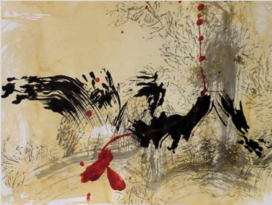
PDF9 Dancing Brush 2 24" x 18" Acrylic & ink on watercolor paper