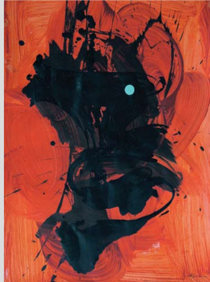
PDF18 Turquoise Pearl 2 22" x 30" Enamel and Acrylic on watercolor paper