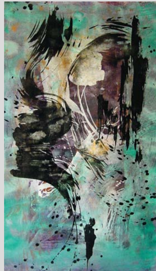
PDF20 Indian Summer 31" x 4' 3" Acrylic & Sumi Ink w/ gold & copper leaf metallic powder on canvas