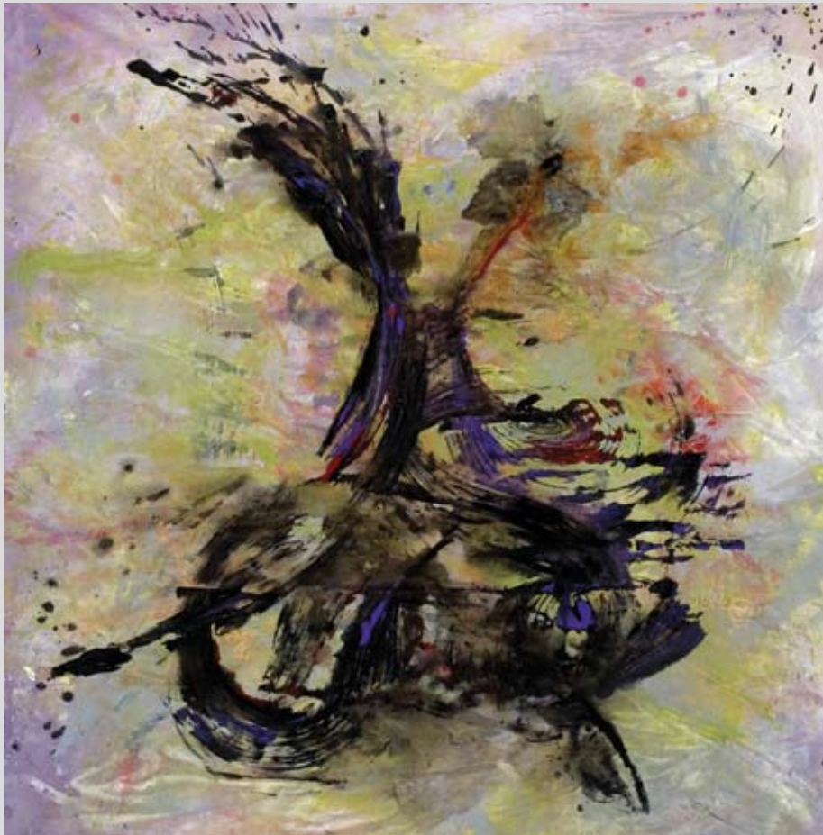
PDF27 Oasis of Ebony 4' x 4' 3" Acrylic with gold leaf metallic powder on canvas