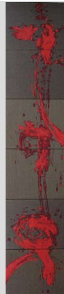
PDF6 6 Panels East Six panels, each 12" x 9" Enamel on raw silk