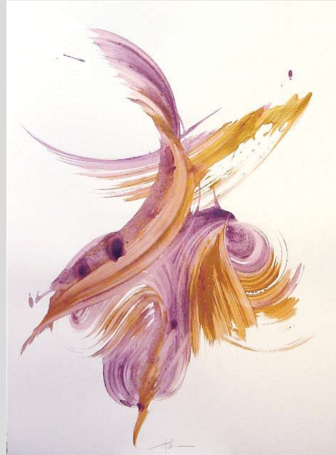
PDF26 Abstract Calligraphy Plum & Gold 1 22" x 30" Acrylic on watercolor paper