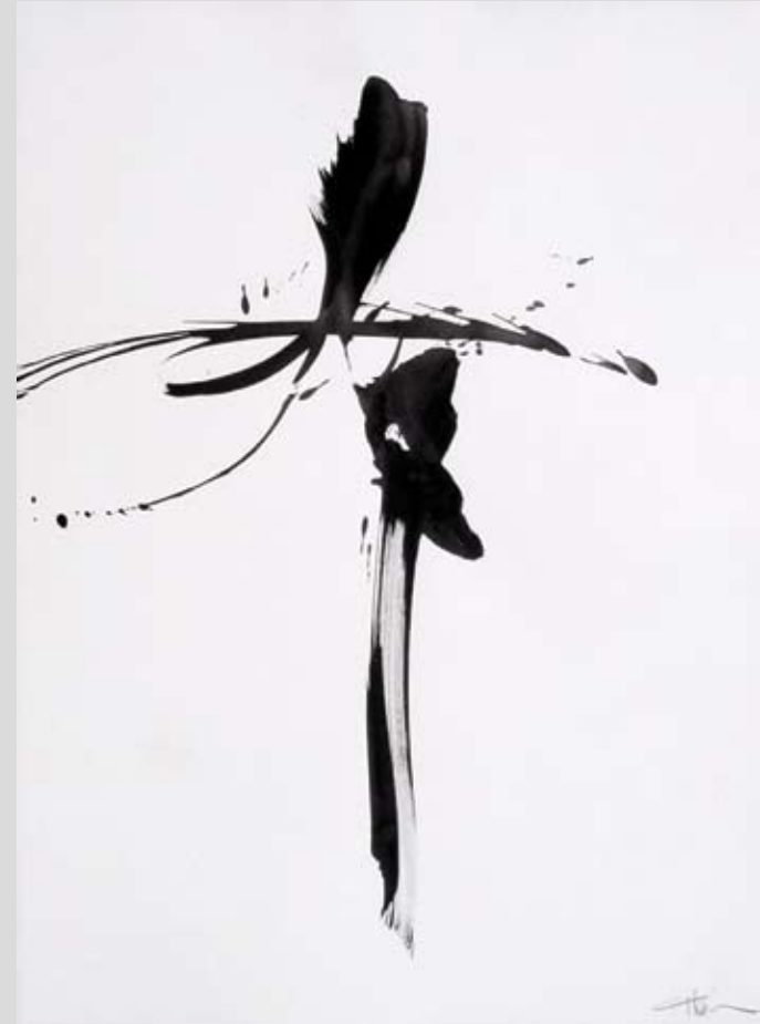
PDF16 Abstract Calligraphy Black/White 3 22" x 30" Sumi Ink on watercolor paper