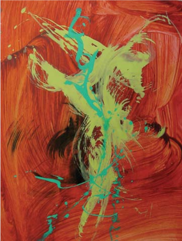
PDF21 Saffron Scribe 1 22" x 30" Sumi Ink & Acrylic on watercolor paper