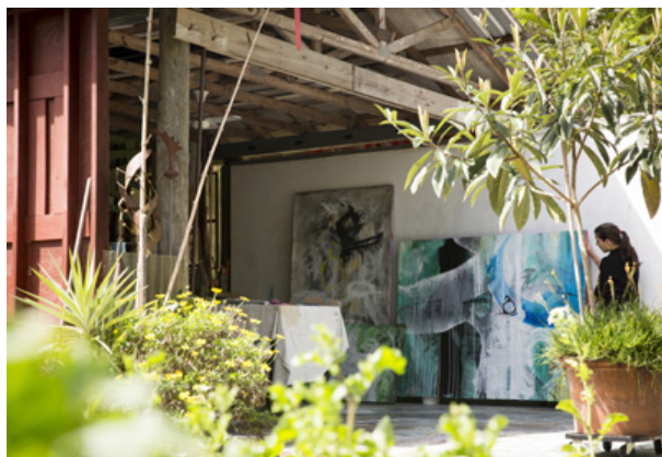
Lake County Tour Stop #5, Brenda Heim Studio

Various genres of artwork range from unique ceramics to large-scale paintings and metal sculptures.