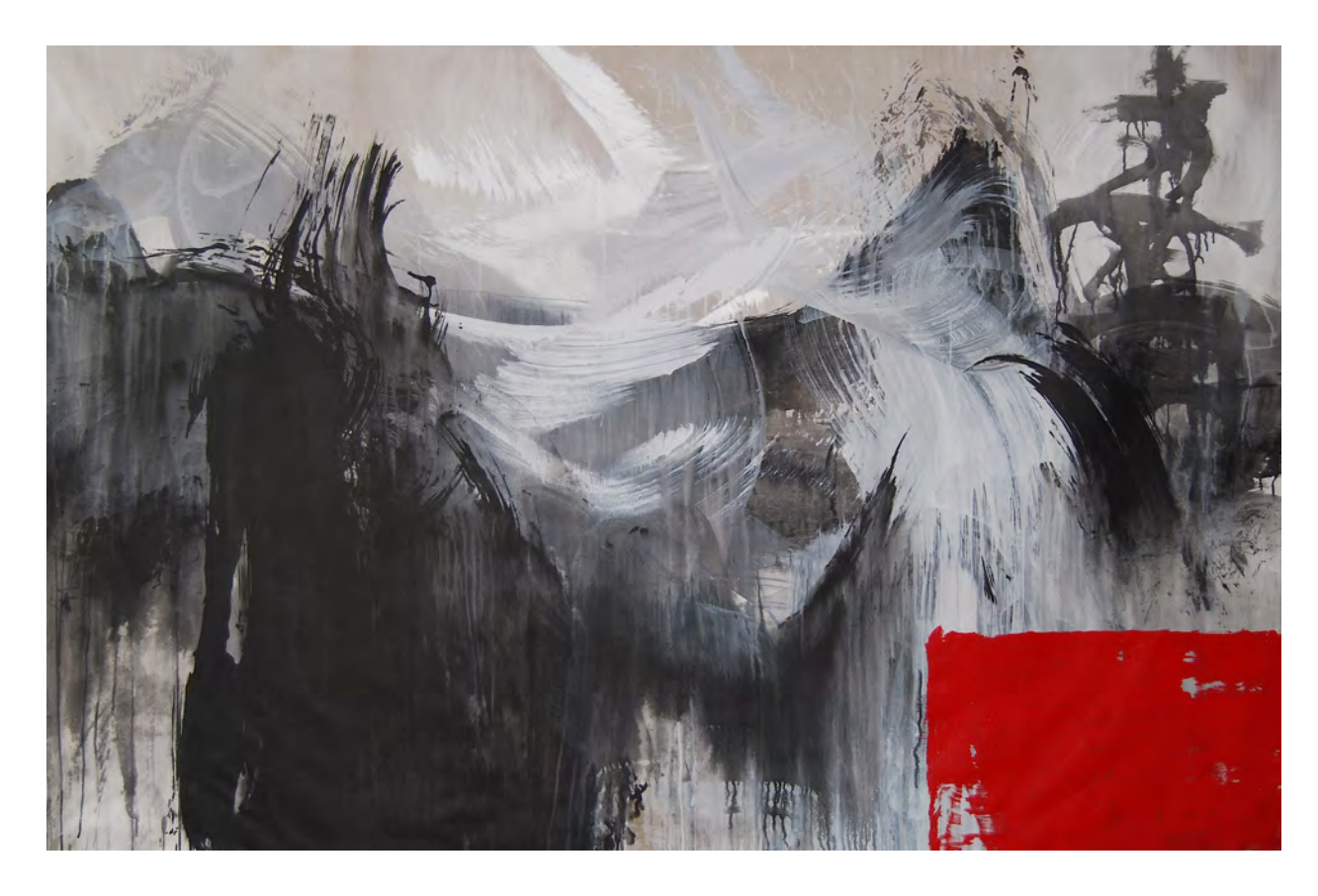
Top: Red Square 3, 6'3" x 4'2" Sumi ink and acrylic on canvas 2013 Sept/Aug Bottom: Red Square 1 Sumi Ink Landscape, 6'10" x 4'2" Sumi ink and acrylic on linen 2013 Sept/Aug